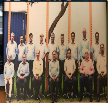
BUSINESS EXCELLENCE ASSESSMENT - AUG 2019